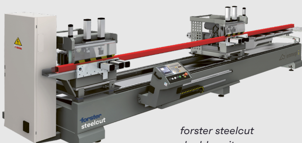
forster steelcut double-mitre saw